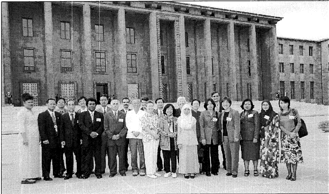
Group photo of Delegates of the APLAP Conference, Outside the Turkish Grand National Assembly