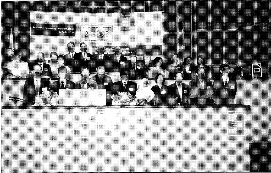
Group photo of Delegates of the 7 th APLAP Conference, Conference Venue, the Turkish Grand National Assembly